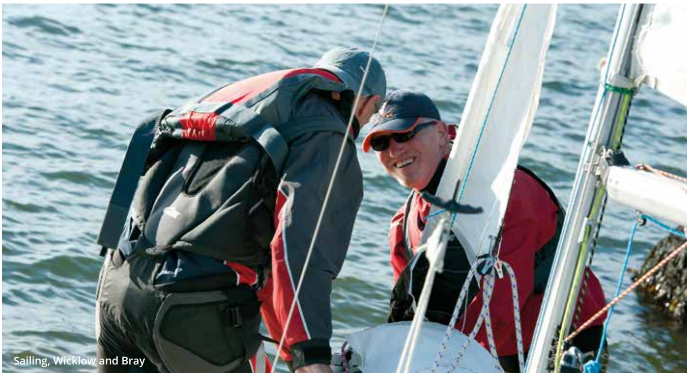
Sailing, Wicklow and Bray