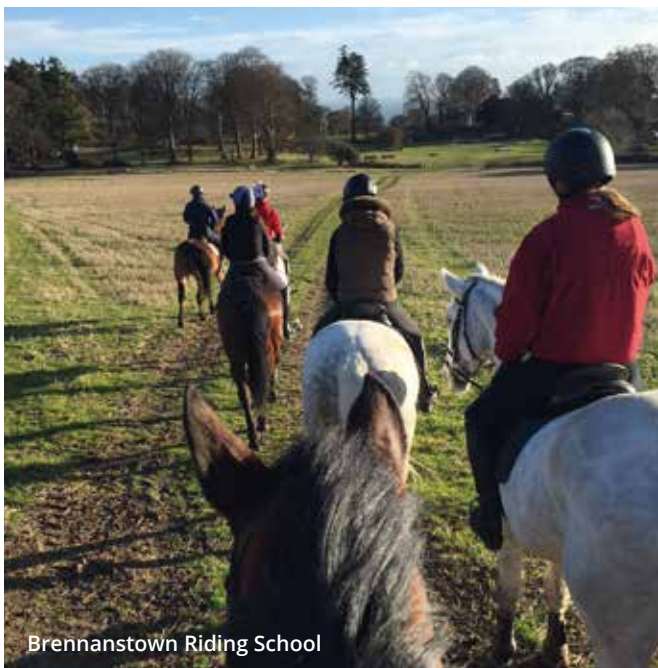
Brennanstown Riding School

No matter what visitors are doing – whether hiking across mountains, paddling up a river, boating across a lake, cycling a Greenway, trekking through forests, landing a fish, rock-pooling, foraging, learning to surf or tee-ing off – there are stories to be told.